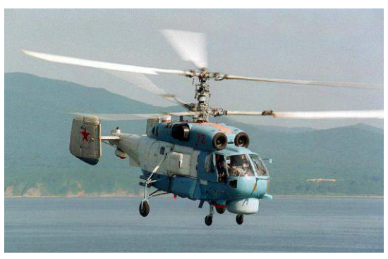
Photo Credit: US Navy, Ka-27 Anti-Submarine Warfare Helicopter, http://commons.wikimedia.org/wiki/File:Kamov Ka-27PS.JPEG