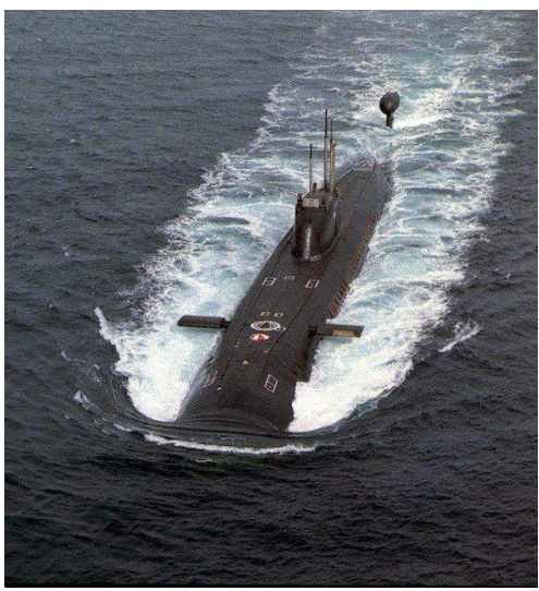
Russian Northern Fleet Victor III

SSN (nuclear powered attack subs, not nuclear armed – 13)