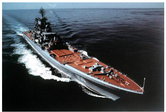
Photo Credit: US Navy, Kirov-class battlecruiser, <a href="http://commons.wikimedia.org/wiki/File:Kirov-class">http://commons.wikimedia.org/wiki/File:Kirov-class</a> battlecruiser.jpg

• Ship has capacity for three Kamov Ka-27PL or Ka-25RT helicopters