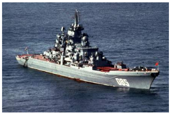
Kalinin 1991 now known as Admiral Nakhimov cruiser