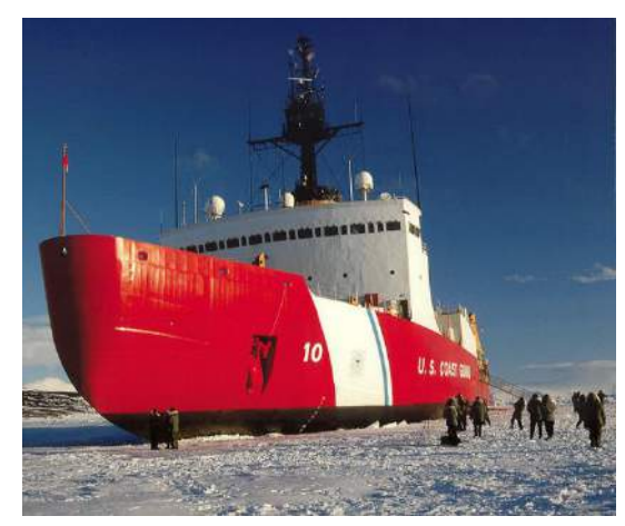
Photo Credit: Polar Star, United States Coast Guard, http://commons.wikimedia.org/wiki/File:Uscgc_polar_star.jpg

Commandant of the Coast Guard, testified that repairing and reactivating Polar Sea for an