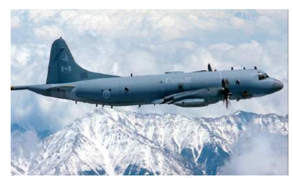
Photo Credit: CP-140 Aurora, Royal Canadian Air Force, http://www.rcaf-arc.forces.gc.ca/en/aircraft.page