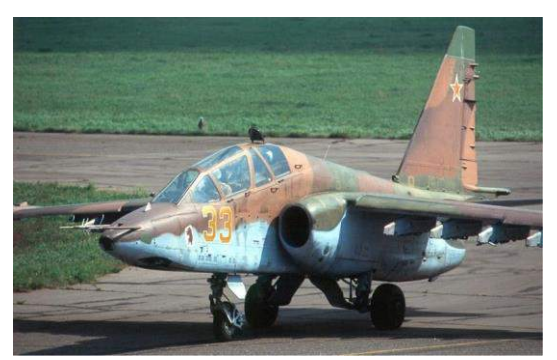
Su-25 UB, used for combat and training