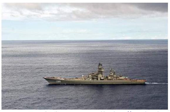
Photo Credit: Russian International News Agency, Russian battlecruiser Pyotr Velikiy, <a href="http://en.wikipedia.org/wiki/File:RIAN">http://en.wikipedia.org/wiki/File:RIAN</a> archive 669522 Long-distance voyage of Pyotr Veliky nuclear-powered cruiser.jpg