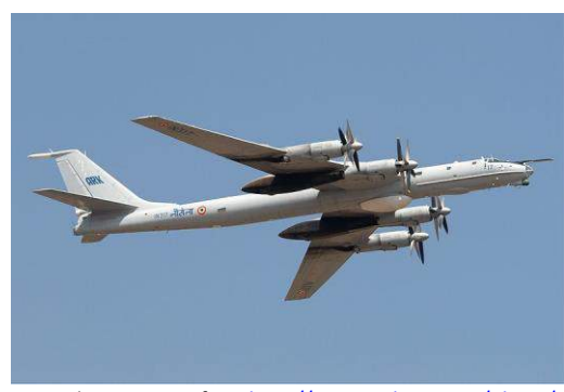
Photo Credit: Sergey Krivchikov, Tu-142 Anti-Submarine Warfare, <a href="http://www.airliners.net/photo/India---Navy/Tupolev-Tu-142/1184007/L/">http://www.airliners.net/photo/India---Navy/Tupolev-Tu-142/1184007/L/</a>