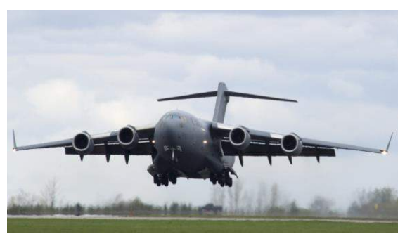
Photo Credit: C-17 Globemaster III, Royal Canadian Air Force, http://www.rcaf-arc.forces.gc.ca/en/aircraft.page