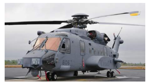
Photo Credit: CH-148 Cyclone, Royal Canadian Air Force, <a href="http://www.rcaf-arc.forces.gc.ca/en/aircraft.page">http://www.rcaf-arc.forces.gc.ca/en/aircraft.page</a>