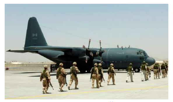
Photo Credit: CC-130 Hercules, Royal Canadian Air Force, <a href="http://www.rcaf-arc.forces.gc.ca/en/aircraft.page">http://www.rcaf-arc.forces.gc.ca/en/aircraft.page</a>

Hercules Transport Aircraft and the CP140 Aurora Maritime Patrol Aircraft." The project will cost between $500 million and $1.5 billion. No anticipated delivery date yet. 82