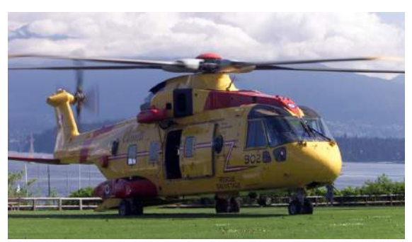
Photo Credit: CH-149 Cormorant, Royal Canadian Air Force, <a href="http://www.rcaf-arc.forces.gc.ca/en/aircraft.page">http://www.rcaf-arc.forces.gc.ca/en/aircraft.page</a>