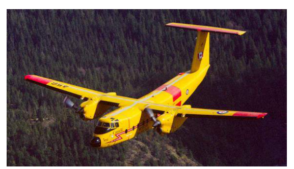
Photo Credit: CC-115 Buffalo, Royal Canadian Air Force, http://www.rcaf-arc.forces.gc.ca/en/aircraft.page

• "All six Canadian Forces CC-115s are employed by 442 Transport and Rescue Squadron out of Comox, British Columbia. The squadron is responsible for an SAR zone stretching from the BC–Washington border to the Arctic, and from the Rocky Mountains to 1200 km out over the Pacific Ocean. With a maximum load of 2727 kg—or 41 fully equipped soldiers—the Buffalo has an operational range of 2240 km." <sup>79</sup>