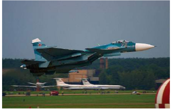
Su-33 Fighter