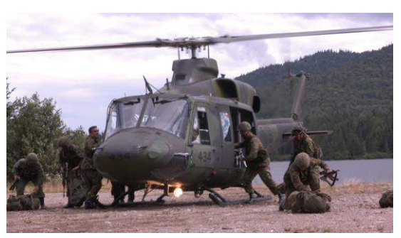
CH-146 Griffon