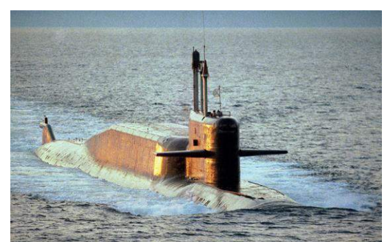
Photo Credit: US Navy, Submarine Delta IV class, http://commons.wikimedia.org/wiki/File:Submarine Delta IV class.jpg

Russia's strategic interests are global and its key ports are in the north (Kola Peninsula) owing to its geography and its need for access to the North Atlantic and beyond.