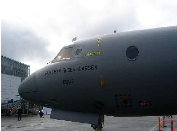
Photo Credit: P-3N Orion from the Royal Norwegian Air Force, http://commons.wikimedia.org/wiki/File:Bergen Air Show 009.jpg