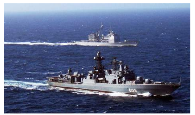
Russian Destroyer Admiral Levchenko