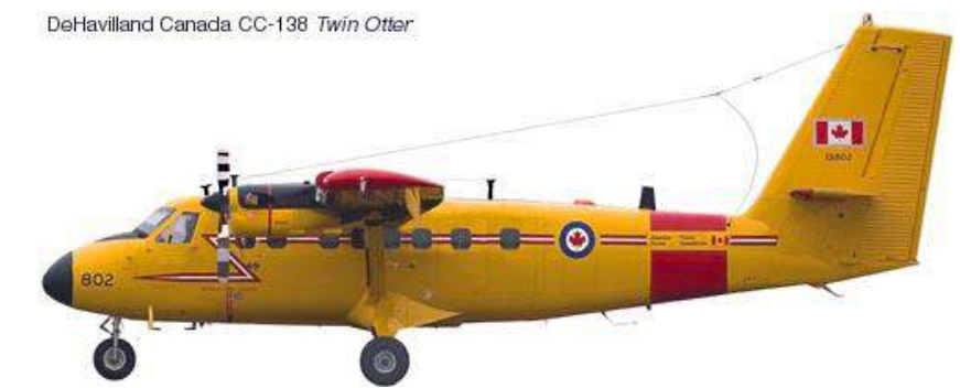
CC-138 Twin Otter side views