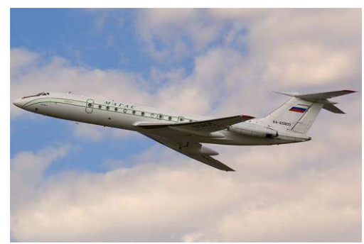
Tu-134 Transport