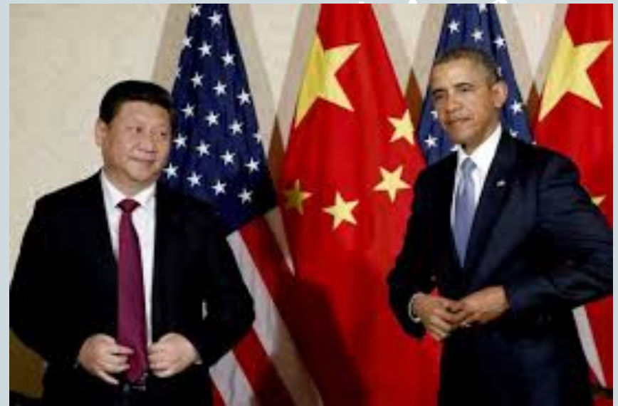
US – China on sanctions