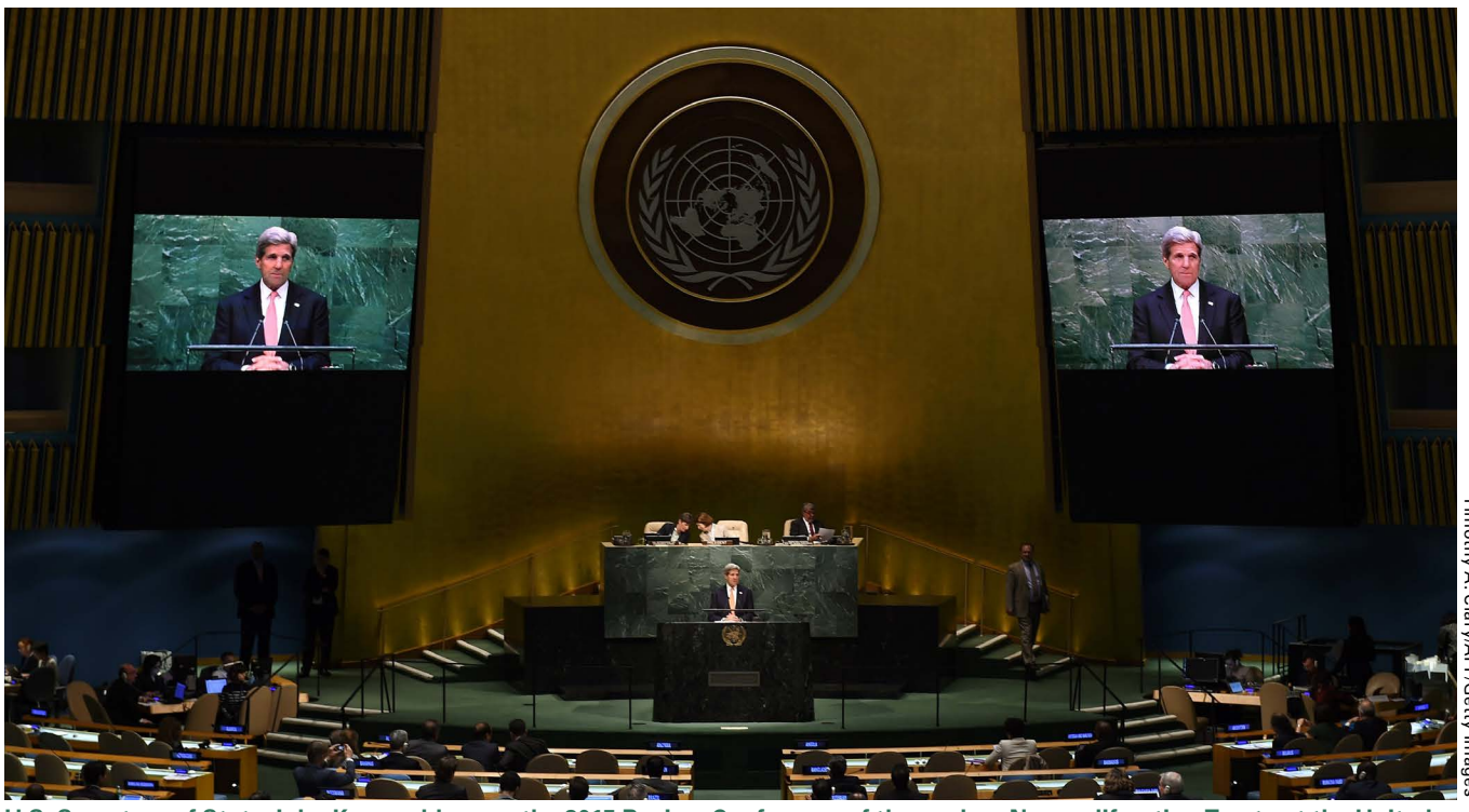
U.S. Secretary of State John Kerry addresses the 2015 Review Conference of the nuclear Nonproliferation Treaty at the United Nations on April 27, 2015.

The CTBT was concluded shortly after the review conference and opened for signature in the fall of 1996. Despite wide support, the treaty has never entered into force due to the failure of eight states specified in a treaty annex to sign and ratify the agreement.