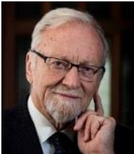
Professor the Hon. Gareth Evans Chancellor, Australian National University Conference Chair

Gareth Evans was Australia's Foreign Minister from 1988-96, President of the International Crisis Group from 2000-09, Co-Chair of the International Commission on Intervention and State Sovereignty 2001, and author of The Responsibility to Protect: Ending Mass Atrocity Crimes Once and for All (Brookings, 2008). He now chairs the International Advisory Board of the Global Centre for the Responsibility to Protect, and has been since 2010 Chancellor of The Australian National University.