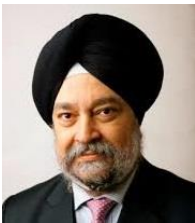
Amb. Hardeep Singh Puri Chairman Research and Information Systems for Developing Countries (RIS)