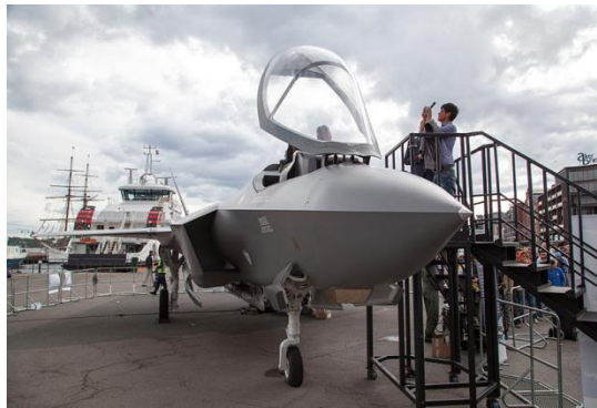
Photo Credit: Tom Bech, F-35, http://commons.wikimedia.org/wiki/File:F-35_and_Boats.jpg