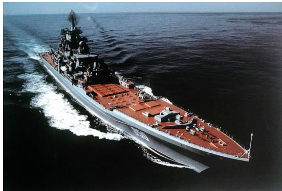
Photo Credit: US Navy, Kirov-class battlecruiser, http://commons.wikimedia.org/wiki/File:Kirov-class_battlecruiser.jpg