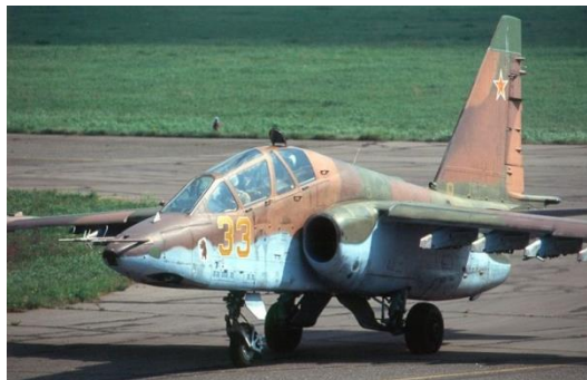
Su-25 UB, used for combat and training