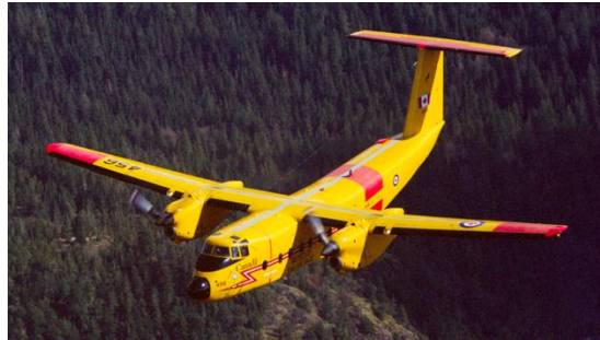
Photo Credit: CC-115 Buffalo, Royal Canadian Air Force, http://www.rcaf-arc.forces.gc.ca/en/aircraft.page