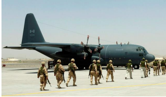
Photo Credit: CC-130 Hercules, Royal Canadian Air Force, http://www.rcaf-arc.forces.gc.ca/en/aircraft.page