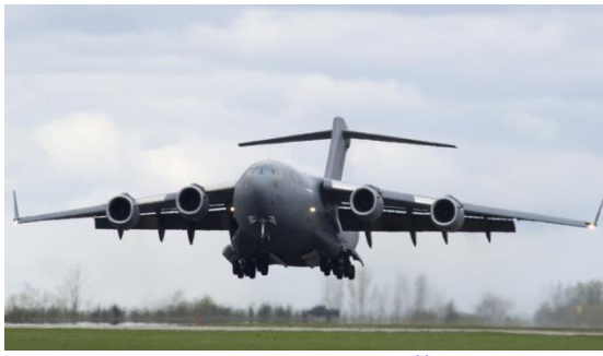
Photo Credit: C-17 Globemaster III, Royal Canadian Air Force, http://www.rcaf-arc.forces.gc.ca/en/aircraft.page