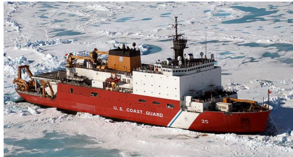
Photo Credit: Healy, United States Coast Guard, http://commons.wikimedia.org/wiki/File:USCGC_Healy_(WAGB-20)_north_of_Alaska.jpg

SIPRI summarizes US icebreaking capacity as follows: