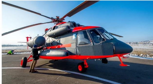
Mil Mi-8AMTSh-VA rotorcraft, http://sputniknews.com/russia/20160319/1036576005/russia-helicopter-arctic.html