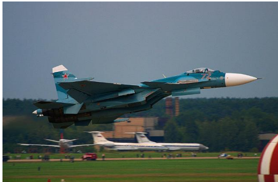
Su-33 Fighter