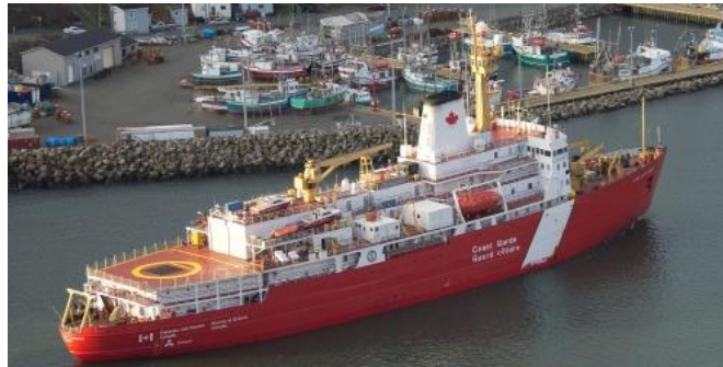
Photo Credit: CCGS Louis S. St-Laurent, Canadian Coast Guard, http://www.ccg-gcc.gc.ca/Fleet/Vessel?vessel_id=81