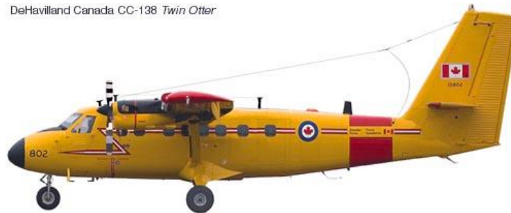
CC-138 Twin Otter side views