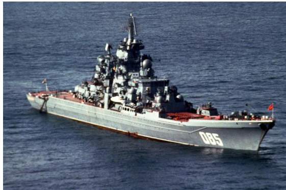
Kalinin 1991 now known as Admiral Nakhimov cruiser