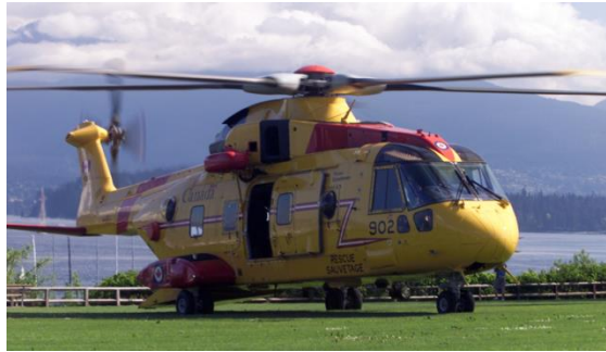
Photo Credit: CH-149 Cormorant, Royal Canadian Air Force, http://www.rcf-arc.forces.gc.ca/en/aircraft.page