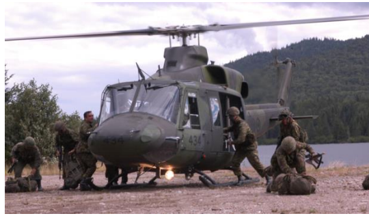
Photo Credit: CH-146 Griffon, Royal Canadian Air Force, http://www.rcaf-arc.forces.gc.ca/en/aircraft.page