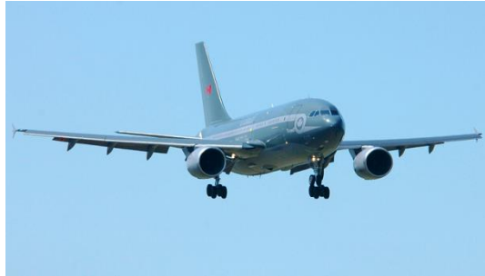
Photo Credit: CC-150 Polaris, Royal Canadian Air Force, http://www.rcaf-arc.forces.gc.ca/en/aircraft.page