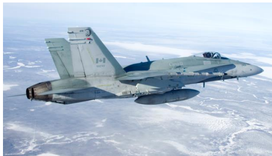
Photo Credit: CF-188 Hornet, Royal Canadian Air Force, http://www.rcf-arc.forces.gc.ca/en/aircraft.page