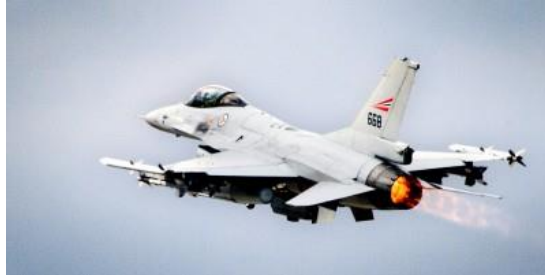
Photo Credit: Forsvaret/Lars Magne Hovtun, F-16, http://www.newsinenglish.no/2011/10/27/new-fighter-jets-lack-arctic-abilities/