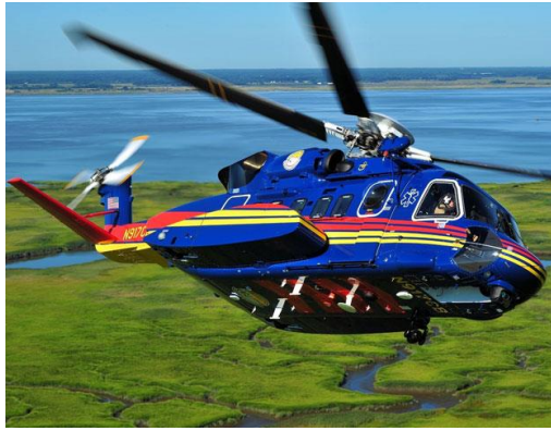
Photo Credit: S-92 Helicopter, Skip Robinson, Sikorsky, https://americansecuritytoday.com