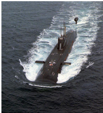
Photo Credit: US Navy, Russian Northern Fleet Victor III, http://commons.wikimedia.org/wiki/File:Victor_III_class_submarine_1997.jpg

SSN (nuclear powered attack subs, not nuclear armed – 13)