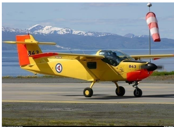
Photo Credit: Tom Strom, Norway Airforce - Saab MFI-15 Safari, http://www.airliners.net/search/photo.search?id=0591096