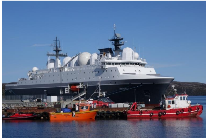
Marjata IV at port in Kirkenes, http://www.rcinet.ca

substantially larger than the others, being 126 meters (413 feet) long and 23.5 meters (77 feet) wide, and will have costed Norwegian military approximately $170 million. 539 Norway will keep the Marjata IV's predecessors in service, doubling Norway's capability, and IHS Jane's 360 reports that this vessel "has already deployed to take up surveillance and reconnaissance duties, alongside other NATO vessels, in and around the Arctic region". 540