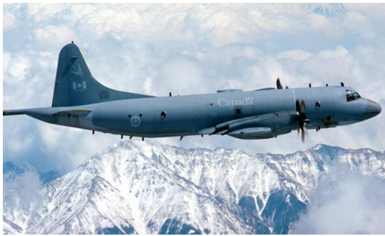
Photo Credit: CP-140 Aurora, Royal Canadian Air Force, http://www.rcf-arc.forces.gc.ca/en/aircraft.page