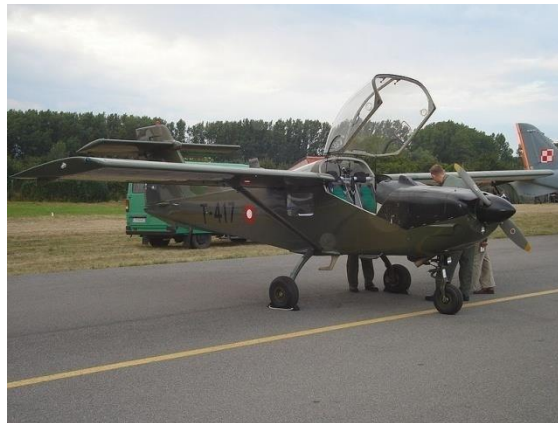
Photo Credit: Picture of Saab MFI-17 Supporter, Radom Air Show 2007, http://commons.wikimedia.org/wiki/File:MFI-17_Supporter,_Radom_Air_Show_2007.jpg