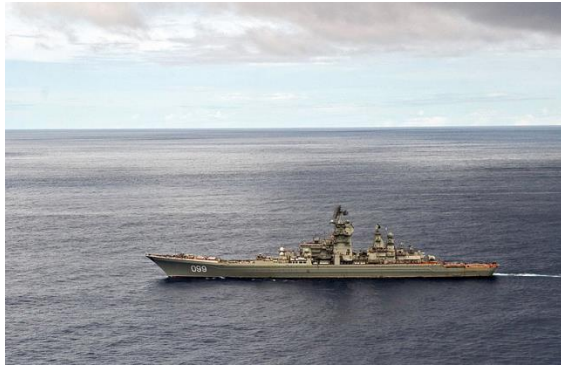
Photo Credit: Russian International News Agency, Russian battlecruiser Pyotr Velikiy, http://en.wikipedia.org/wiki/File:RIAN_archive_669522_Long-distance_voyage_of_Pyotr_Veliky_nuclear-powered_cruiser.jpg