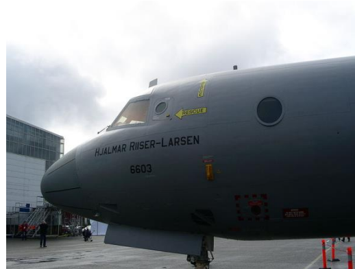
P-3N Orion from the Royal Norwegian Air Force