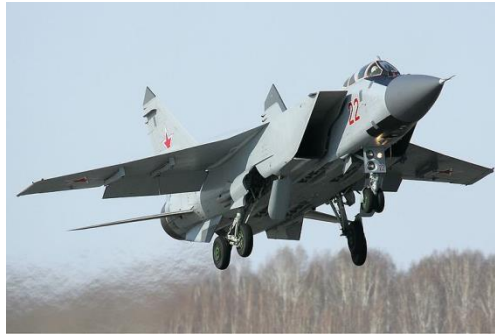
Photo Credit: Dmitry Pichugin Russian Air Force MiG-31 BM, http://www.airliners.net/photo/Russia---Air/Mikoyan-Gurevich-MiG-31BM/2126525/L/