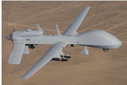
Photo Credit: MQ-1C Gray Eagle, General Atomics Aeronautical, http://www.ga-asi.com/gray-eagle