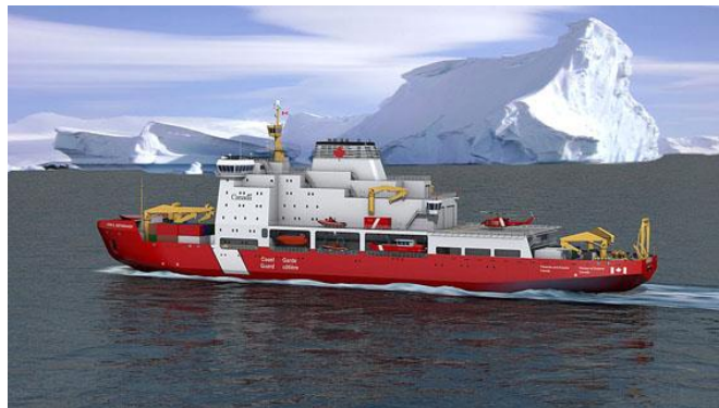
Artist's conception of CCGS John G. Diefenbaker