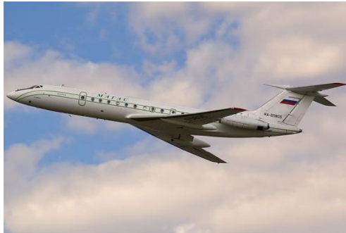
Photo Credit: Gennady Misko, Tu-134 Transport, http://commons.wikimedia.org/wiki/File:MAGAS_Kosmos_Tupolev_Tu-134_Misko.jpg