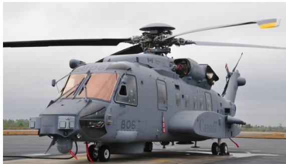
CH-148 Cyclone