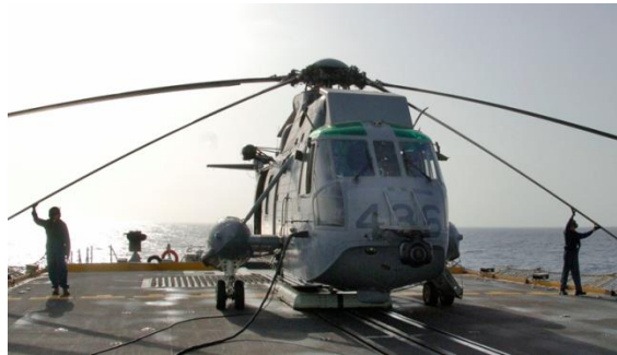
CH-124 Sea King