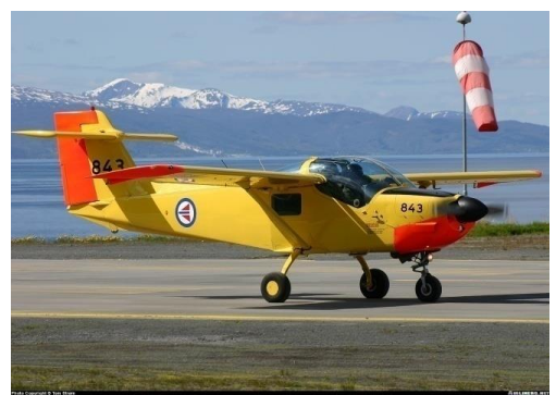
Photo Credit: Tom Strom, Norway Airforce - Saab MFI-15 Safari, http://www.airliners.net/search/photo.search?id=0591096