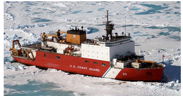
Photo Credit: Healy, United States Coast Guard, http://commons.wikimedia.org/wiki/File:USCGC_Healy_(WAGB-20)_north_of_Alaska.jpg

SIPRI summarizes US icebreaking capacity as follows: