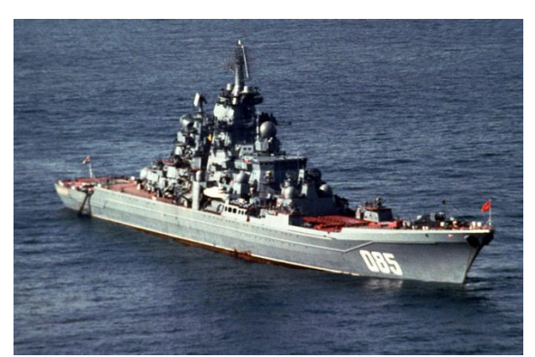
Photo Credit: US Navy, Kalinin 1991 now known as Admiral Nakhimov cruiser, http://commons.wikimedia.org/wiki/File:BCGN Kalinin 1991.jpg