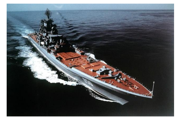
Photo Credit: US Navy, Kirov-class battlecruiser, http://commons.wikimedia.org/wiki/File:Kirov-class battlecruiser.jpg