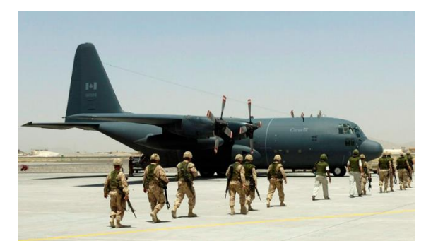
Photo Credit: CC-130 Hercules, Royal Canadian Air Force, http://www.rcaf-arc.forces.gc.ca/en/aircraft.page