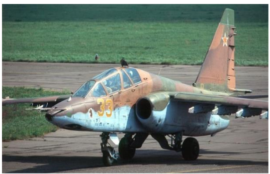
Photo Credit: Su-25 UB, used for combat and training, http://commons.wikimedia.org/wiki/File:Russian Air Force Su-25.jpg