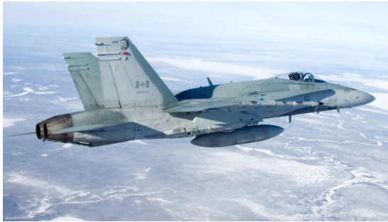
CF-188 Hornet