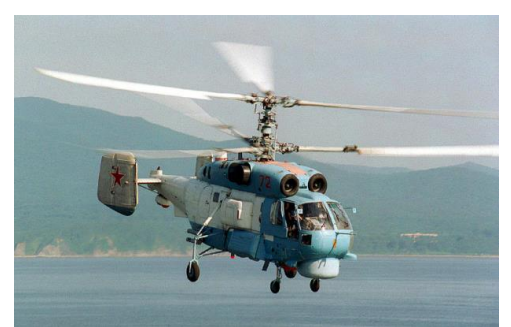
Ka-27 Anti-Submarine Warfare Helicopter

Ka-27 Anti-Submarine Warfare Helicopters