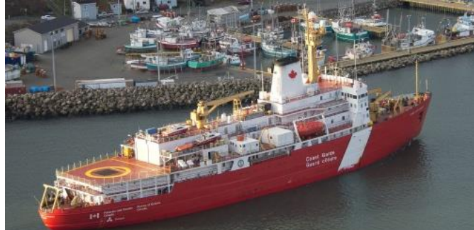
Photo Credit: CCGS Louis S. St-Laurent, Canadian Coast Guard, http://www.ccg-gcc.gc.ca/Fleet/Vessel?vessel_id=81