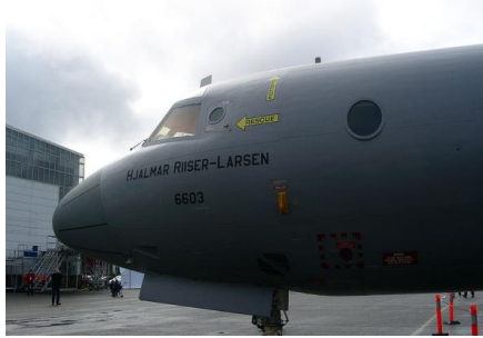
Photo Credit: P-3N Orion from the Royal Norwegian Air Force, http://commons.wikimedia.org/wiki/File:Bergen Air Show 009.jpg