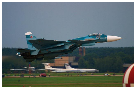
Su-33 Fighter