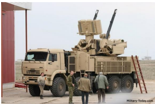
SA-22 Pantsir-S1