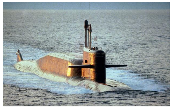
Submarine Delta IV class

• "Podmoskovye" will probably be used as carrier for the "Losharik" deep diving titanium submarine.<sup>348</sup>