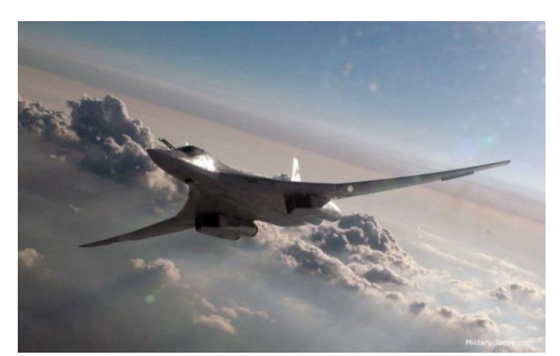
Photocredit: Military-today.com, Tu-160M2, http://www.military-today.com