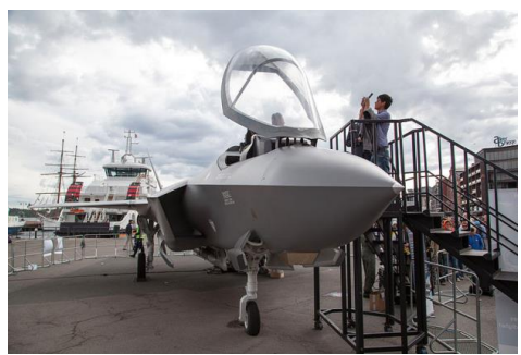
Photo Credit: Tom Bech, F-35, http://commons.wikimedia.org/wiki/File:F-35 and Boats.jpg