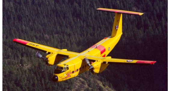
CC-115 Buffalo

"All six Canadian Forces CC-115s are employed by 442 Transport and Rescue Squadron out of Comox, British Columbia. The squadron is responsible for an SAR zone stretching from the BC–Washington border to the Arctic, and from the Rocky Mountains to 1200 km out over the Pacific Ocean. With a maximum load of 2727 kg—or 41 fully equipped soldiers—the Buffalo has an operational range of 2240 km."<sup>87</sup>