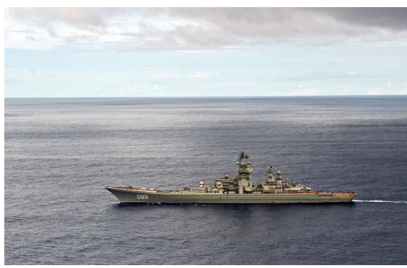
Photo Credit: Russian International News Agency, Russian battlecruiser Pyotr Velikiy, http://en.wikipedia.org/wiki/File:RIAN archive 669522 Long-distance voyage of Pyotr Veliky nuclear-powered cruiser.jpg