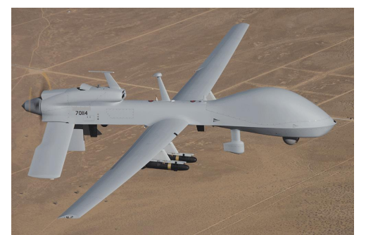
Photo Credit: MQ-1C Gray Eagle, General Atomics Aeronautical, http://www.ga-asi.com/gray-eagle