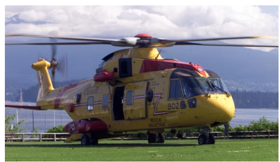
CH-149 Cormorant