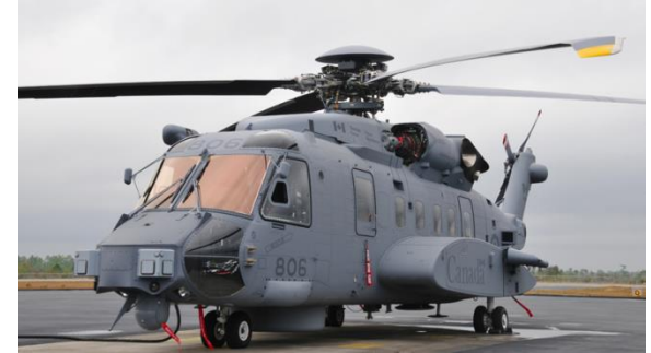
Photo Credit: CH-148 Cyclone, Royal Canadian Air Force, http://www.rcaf-arc.forces.gc.ca/en/aircraft.page