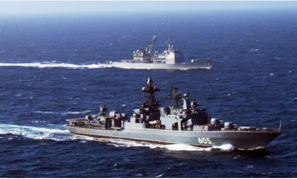
Photo Credit: US Navy, Russian Destroyer Admiral Levchenko http://commons.wikimedia.org/wiki/File:RFNS_Admiral_Levchenko_DDG-605.jpg

<sup>409</sup> "Russian missile cruiser joins Northern Fleet drills in Barents Sea," TASS, 27 May 2016, http://tass.ru