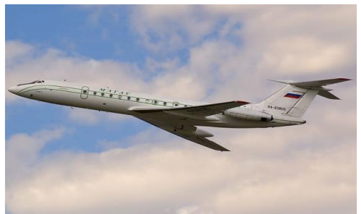
Photo Credit: Gennady Misko, Tu-134 Transport, http://commons.wikimedia.org/wiki/File:MAGAS Kosmos Tupolev Tu-134 Misko.jpg

Ka-27 Anti-Submarine Warfare Helicopters