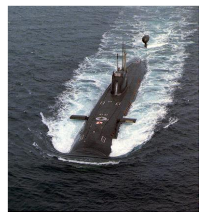
Russian Northern Fleet Victor III

SSN (nuclear powered attack subs, not nuclear armed - 13)