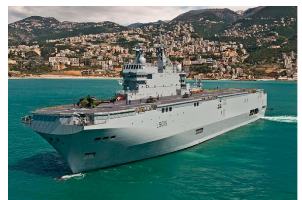
Photo Credit: BPS Dixmude, <u>http://commons.wikimedia.org/wiki/File:BPC_Dixmude.jpg</u>