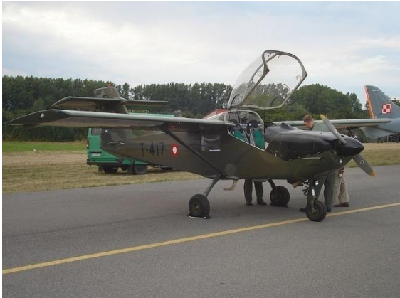
Picture of Saab MFI-17 Supporter, Radom Air Show 2007