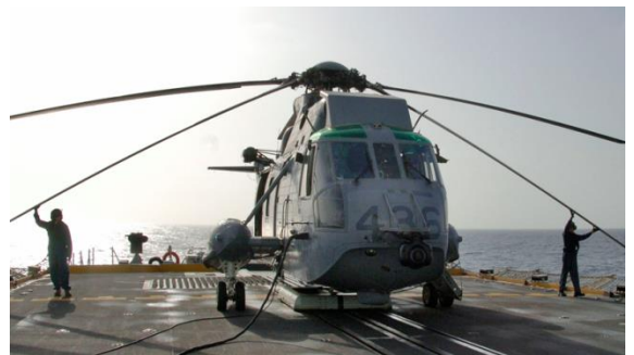
CH-124 Sea King