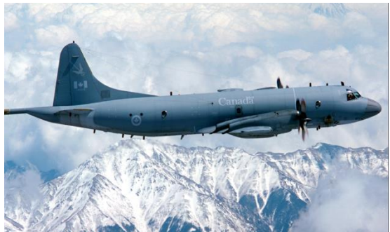
CP-140 Aurora