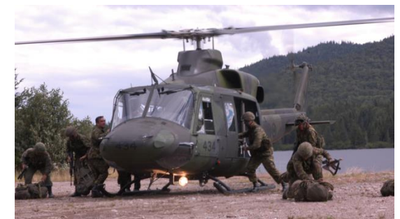
Photo Credit: CH-146 Griffon, Royal Canadian Air Force, http://www.rcaf-arc.forces.gc.ca/en/aircraft.page