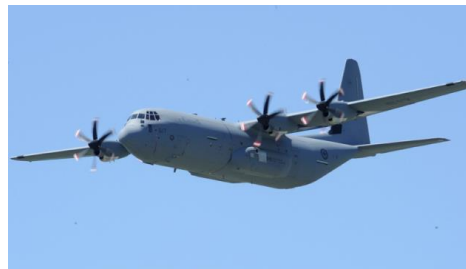
Photo Credit: CC-130J Hercules, Royal Canadian Air Force, http://www.rcaf-arc.forces.gc.ca/en/aircraft.page