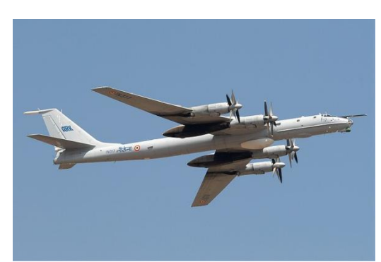
Tu-142 Anti-Submarine Warfare