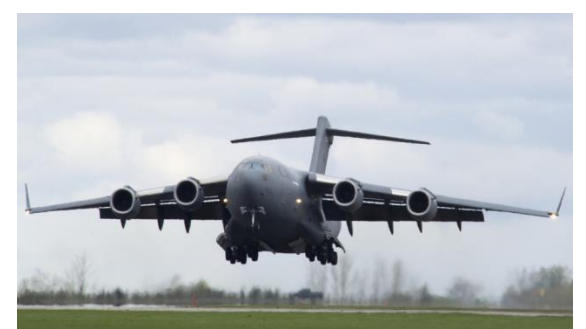
Photo Credit: C-17 Globemaster III, Royal Canadian Air Force, http://www.rcaf-arc.forces.gc.ca/en/aircraft.page