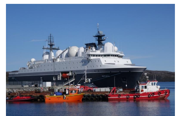
Marjata IV at port in Kirkenes, http://www.rcinet.ca

A new Norwegian military intelligence vessel, the "Marjata," the same name that was given to all three earlier vessels in this role over a 60-year period, entered into service in April 2016<sup>454</sup>. The Marjata IV will be substantially larger than the others, being 126 meters (413 feet) long and 23.5 meters (77 feet) wide, and will have costed Norwegian military approximately $170 million.<sup>455</sup> Norway will keep the Marjata IV's predecessors in service, doubling Norway's capability, and IHS Jane's 360 reports that this vessel "has already deployed to take up surveillance and reconnaissance duties, alongside other NATO vessels, in and around the Arctic region".<sup>456</sup>