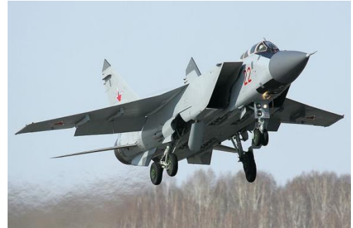
Russian Air Force MiG-31 BM