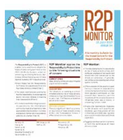
Global Centre for R2P's R2P Monitor is a bimonthly bulletin applying the Responsibility to Protect lens to populations at risk of mass atrocities around the world.

In addition there have been a great many books and articles written on the subject of R<sub>2</sub>P, and an academic journal – Global Responsibility to Protect – is devoted to it. An entire academic sub-industry has developed dedicated to analyzing, researching and critiquing R<sub>2</sub>P.