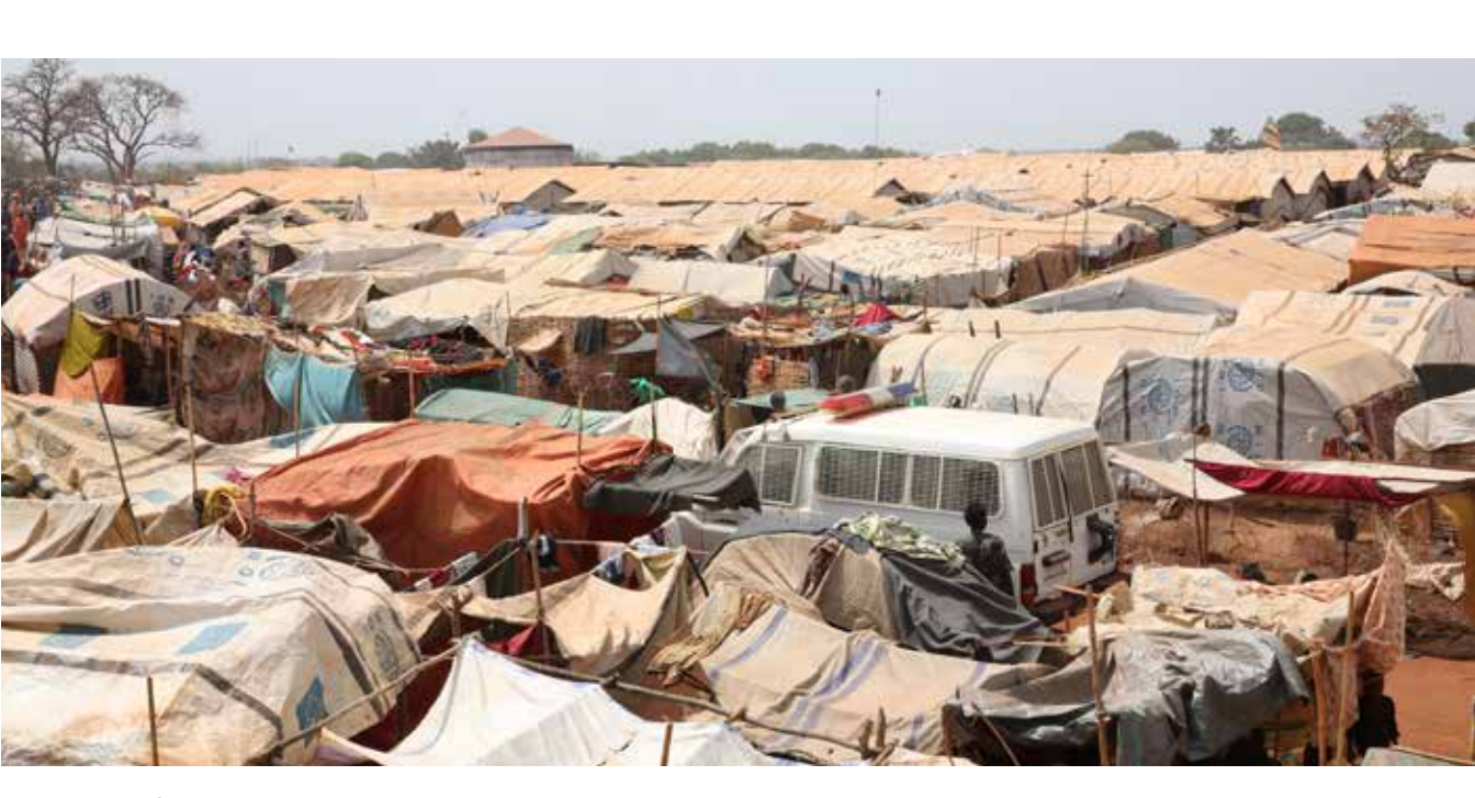
A recent upsurge in violence beginning 10 April 2017 has displaced thousands of people in South Sudan's Wau town.

There was recognition that these matters are complex and require on-going dialogue such as occurred during The Simons Forum. There is need for a regular opportunity to reflect, share experiences and perspectives to refresh and maintain enthusiastic commitment to the implementation of the Responsibility to Protect.