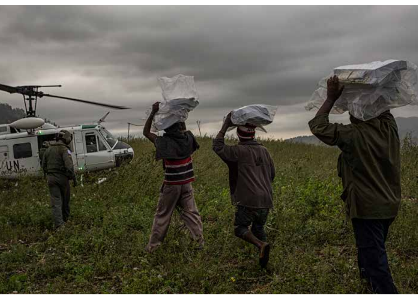
Following Haiti's general elections, held on 20 November 2016, election materials are collected from Anjou, a small town in the mountains above Haiti's capital, Port au Prince, by Chilean peacekeepers serving with the United Nations Mission in Haiti.