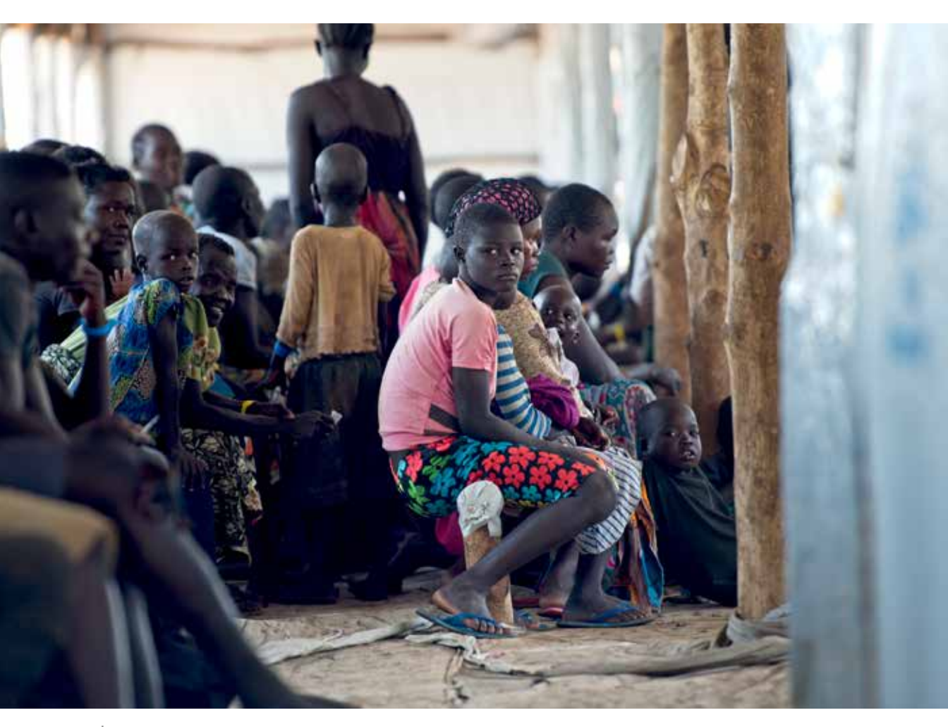
The UN Refugee Agency (UNHCR) and partners opened a new settlement area in Arua district, northern Uganda, in February 2017, to host thousands of refugees arriving from South Sudan.