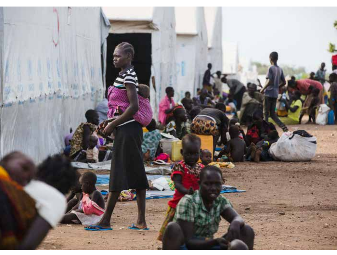
Refugees from South Sudan at the Imvepi refugee camp in Arua district, northern Uganda.