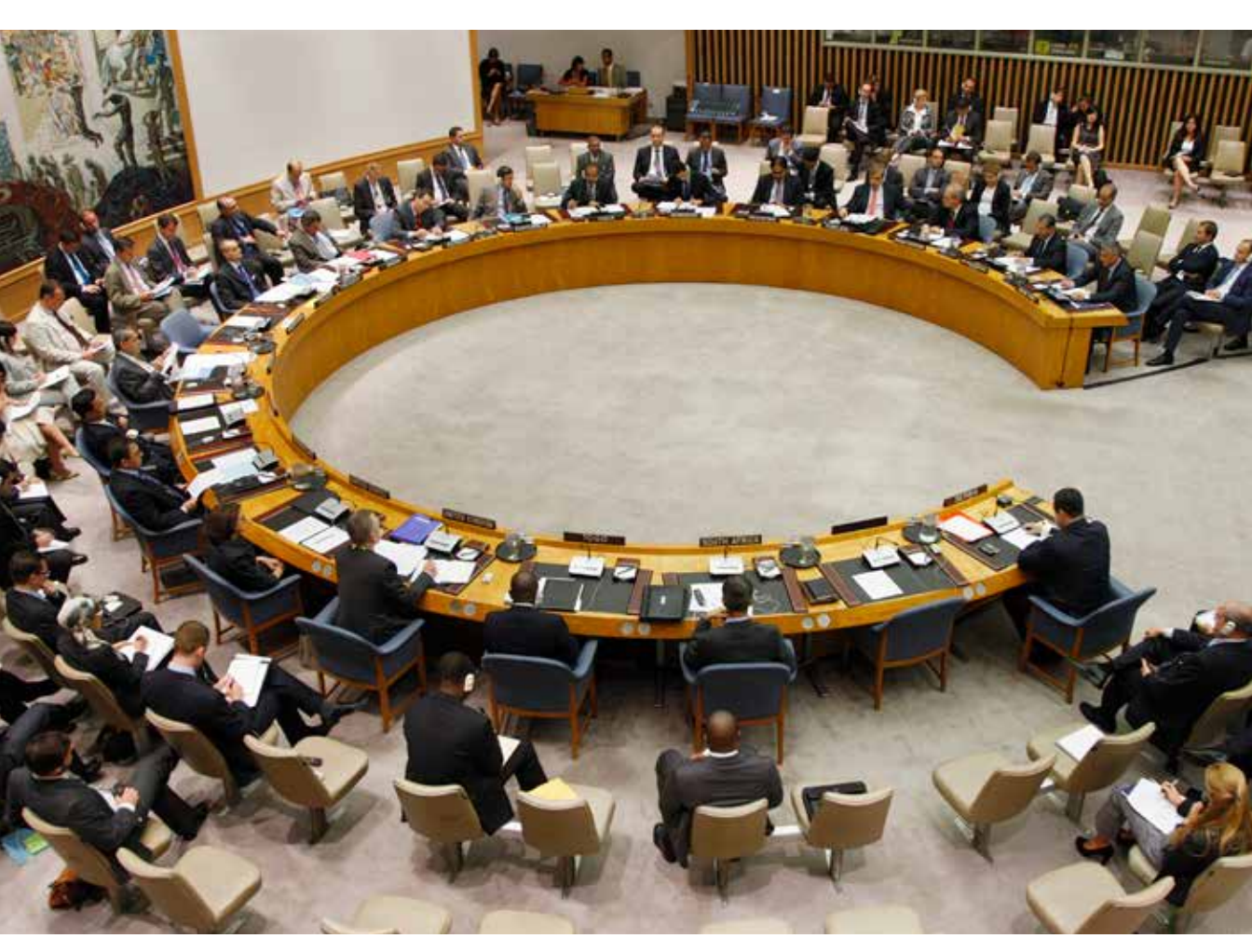
| Security Council Debates Kosovo